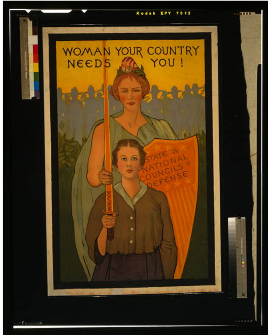
(Posters: World War I Posters. Library of Congress Prints and Photographs Division, Washington, D.C.)