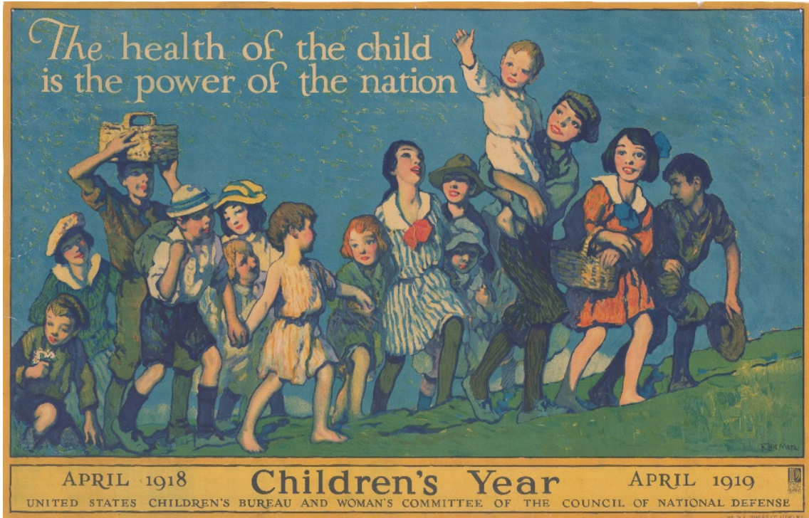
(F. Louis Mora, "The Health of the Child is the Power of the Nation," 1918 (poster).)